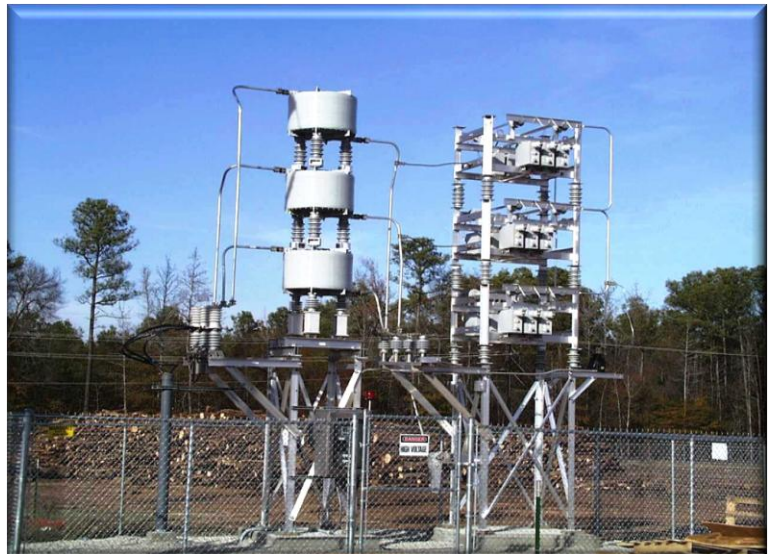
Pulp & Paper Manufacturing